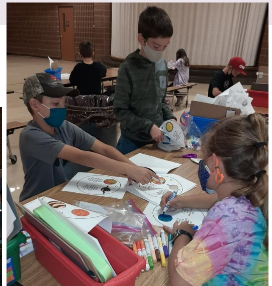
Grayside 5th graders working on a STEM project